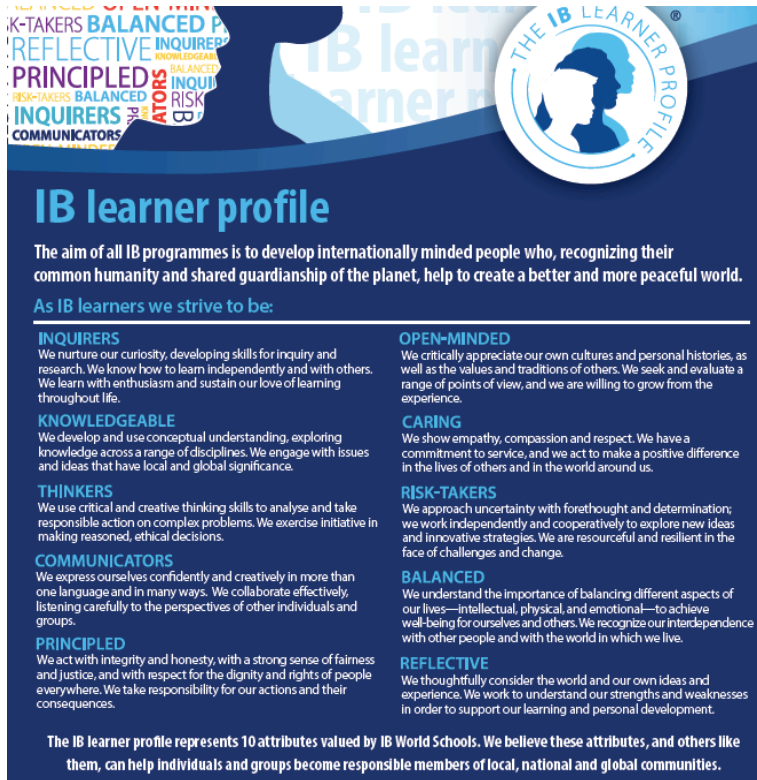
IB Learner Profile Attributes

Imagine a worldwide community of schools, educators and students with a shared vision and mission to empower young people with the skills, values and knowledge to create a better and more peaceful world. This is the International Baccalaureate (IB).