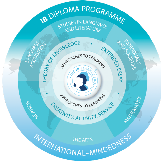
IB Diploma Programme Framework

IB Diploma Programme (DP) is a 2-year programme, which begins in grade 11 and continues into grade 12. Successful completion of the programme framework will earn students the IB Diploma. Students can apply to post-secondary using unique admission criteria as IB DP students.