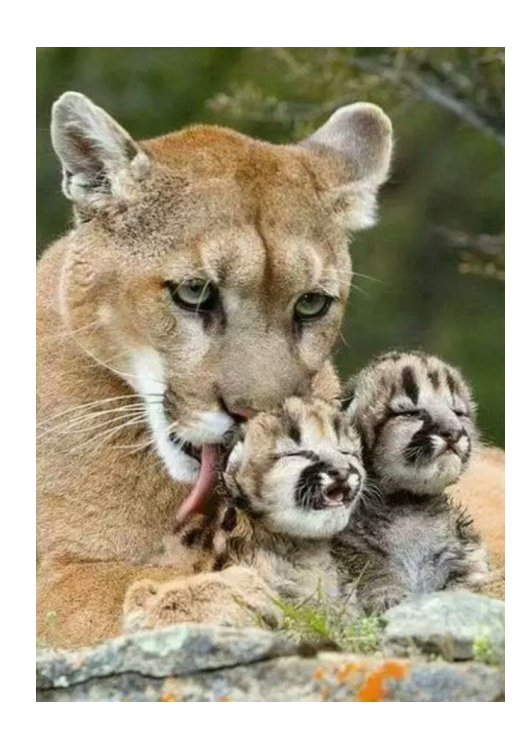
We have one goal: To be a kind, cooperative Cougar Family!!