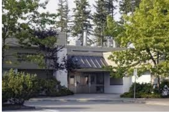
Panorama Park Elementary