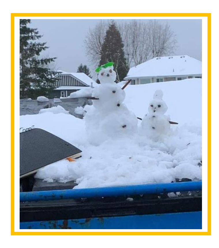
The students had fun making Snowmen.